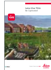
Leica Viva TS16