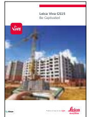
Leica Viva GS15