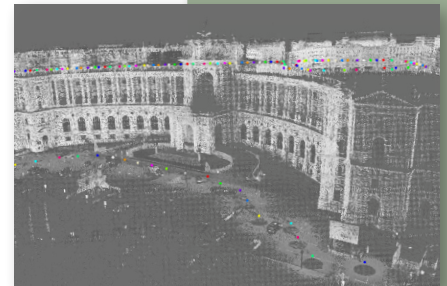
scan data detail, reflectance-scaled