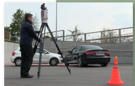
forensics & investigation