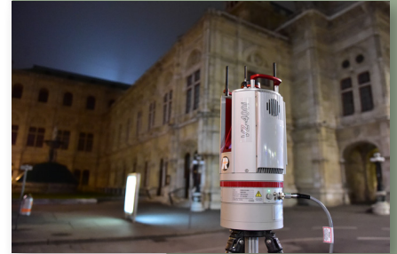
RIEGL VZ-400i night scan in Vienna

One of the fastest scanners on the market: 500+ scans (50 mdeg) within 8 hours, handled by one operator!